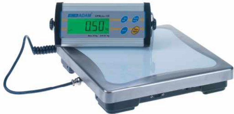
Model CPWplus 150